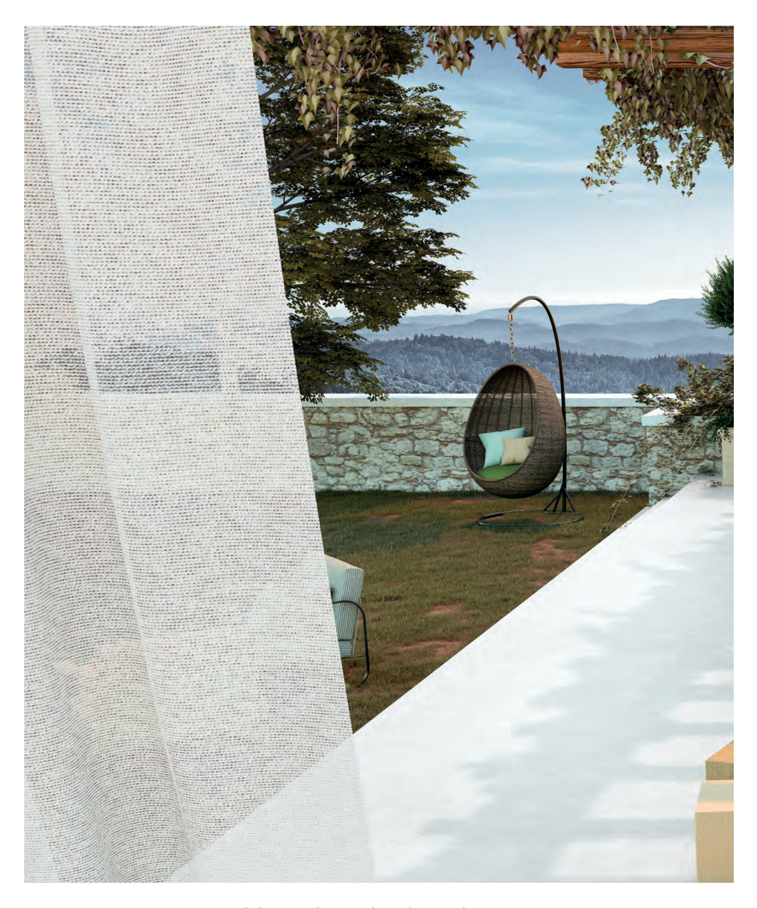
Arise emotions and awake people senses